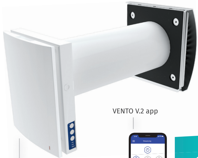
complete unit: VENTO Expert A50-1 S10 W V.2